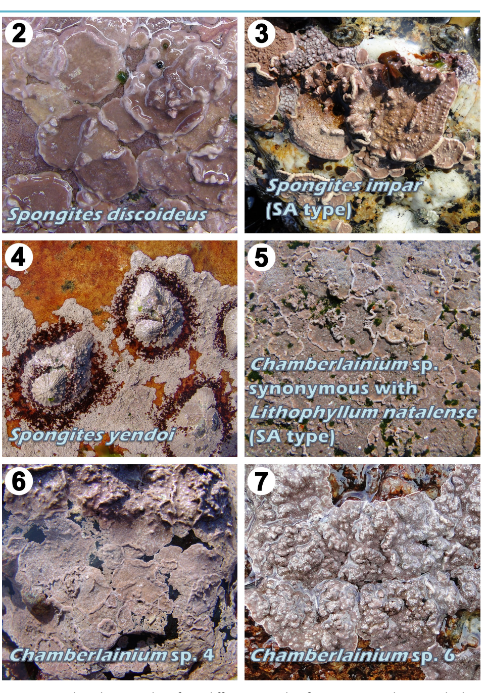
Fig. 2-7. Habit photographs of six different South African species that match the current morphological and anatomical characterisation of the genus Spongites , most of which will have to be transferred to Chamberlainium .

Species ascribed to the 'cosmopolitan' genus Spongites are particularly widespread and common in South Africa (e.g. Figs 2-7). Until recently, all smooth, relatively featureless crusts, conforming to Spongites in South Africa, were called Spongites yendoi (Foslie) Y.M.Chamberlain. Consequently the species has been reported to be the