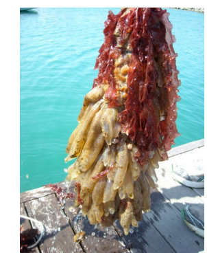
Ciona species invading mussel farms in Saldanha Bay (South Africa)

Ascidians are one of the most notorious groups of alien marine species due to their high propensity to settle on artificial structures and to overgrow and smother native species. Ascidians are often detected in harbours and marinas, and reporting non-native ascidians at these sites is key for forecasting future biological invasions. However, identifying new arrivals is a challenge, as it requires detailed taxonomic knowledge.