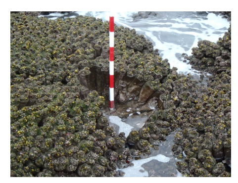
Pyura (redbait) species invasive in Antofasta Bay (Chile)

Who: Postgraduate students and researchers are encouraged to apply.